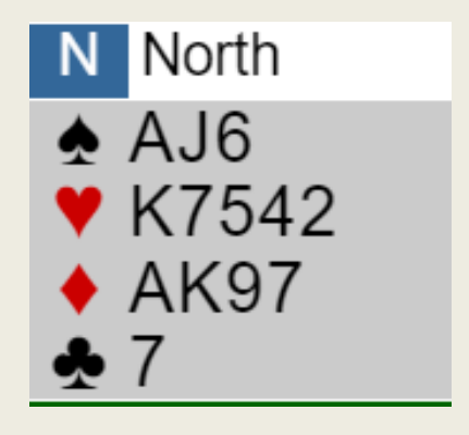
East leads ◆ Q

After East leads the \(\phi\)Q you put your hand down. These are the two hands: